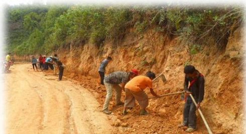
Cash-for-work activities in progress for new access road, Loukkai, Shan