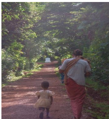
A newly constructed road

The visit is facilitated by the International Rescue Committee (IRC), the United Nations Development Programme's (UNDP) infrastructure partner in Kayah state. The construction of roads, bridges, culverts and community halls using community labour through cash-for-work schemes is meeting critical infrastructure needs and contributing to quick-impact income-generation in the target villages. Visits such as this one are helping to strengthen relationships and networks between these ethnically-diverse and otherwise isolated communities.