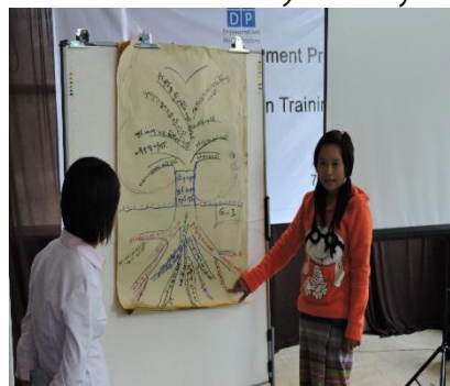
A participant presents a conflict tree

The trainings covered concepts, skills and tools for social cohesion, and gave participants opportunities to test their knowledge in real time. For example, in one activity, participants were asked to analyze a dispute among neighboring villages using conflict analysis tools. In Hpaan, they identified the lack of water as a root cause of the conflict and shared ideas on what kind of intervention could help the situation. In another activity, participants designed a community dialogue process and used dialogue facilitation skills to mediate a conflict between the community, the local government representative and a development agency.